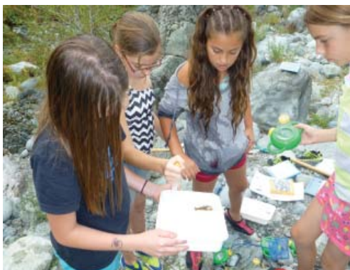
Capturing water bugs to assess water quality.

Sixth grade students from Hayfork Elementary School and Weaverville's Trinity Preparatory Academy attended environmental camp in early October. HES students attended a one day field trip, while TPA students spent two nights and three days at camp. TCRCD receives funding from the Trinity River Restoration Program to create curriculum, find and coordinate volunteers and teach at this Trinity County institution. The US Forest Service, Natural Resources Conservation Service, Watershed Center and local citizens all contribute to make this camp memorable.