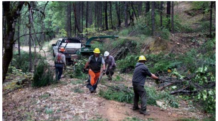
Drought crew chipping in the Weaverville Community Forest.

The cumulative work accomplished through this drought grant contributed significantly to the stewardship of these public lands while providing much needed employment within Trinity County.