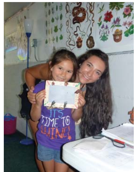
'Look what I made!'