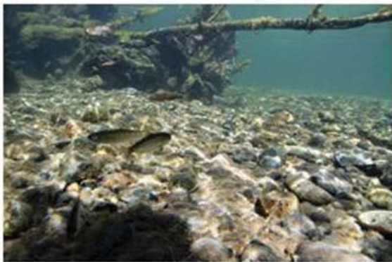
Juvenile fish and adult fish enjoy gravel and wood!