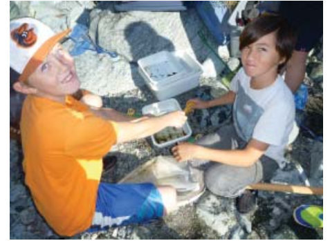
Hayfork Elementary 6th grade students spent their morning learning about creeks and water quality.