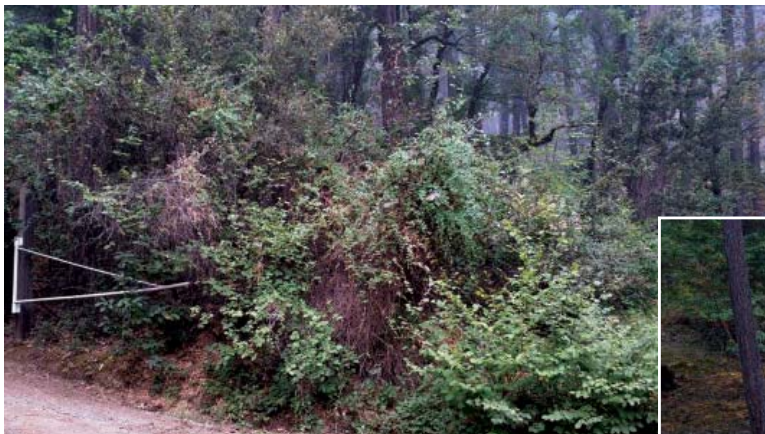
Before fuels reduction work funded by PG&E.

District employees also inventoried, created and installed 43 replacement trail signs on the Weaver Basin Trail System with help from the California Conservation Corps members. This project was funded by the Trinity County RAC.