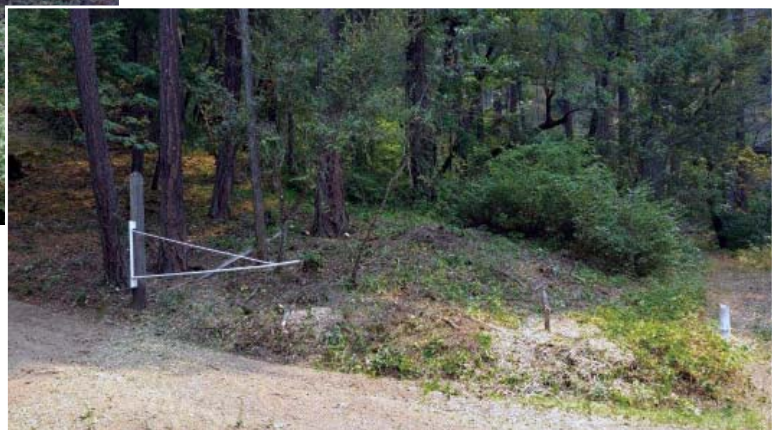
After fuels reduction work.