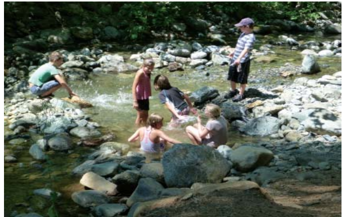
Cooling off in Rush Creek.