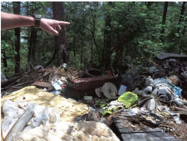
An illegal household garbage dump near Lewiston before cleanup by RCD crews.

All of these sites were nestled in occupied fisher, northern spotted owl and salmonid habitat. Through these integral partners and with funding from CalRecycle, the team removed many miles of irrigation line, tons of trash and pounds of rodenticides that would have posed significant risks to wildlife, fisheries, and the habitats they rely upon.