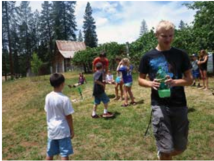
Launching "bottle" rockets during Adventure Week.