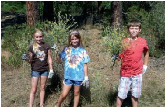
Removing invasive yellow star thistle from the Weaverville Community Forest.