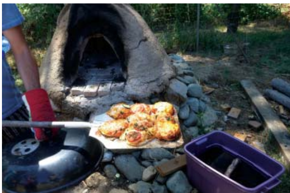
Pizza fresh from the earth oven.