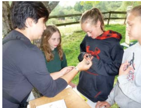
USFS biologists instructed TPA students on bird and data collection.