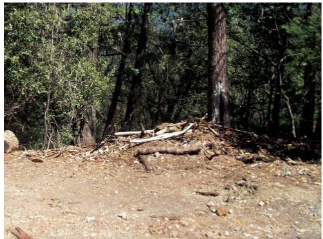
The same site near Lewiston after cleanup.