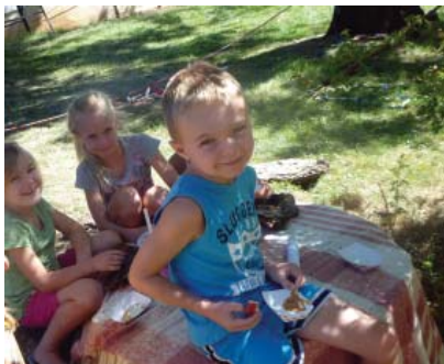
Healthy snacks worthy of smiling about.