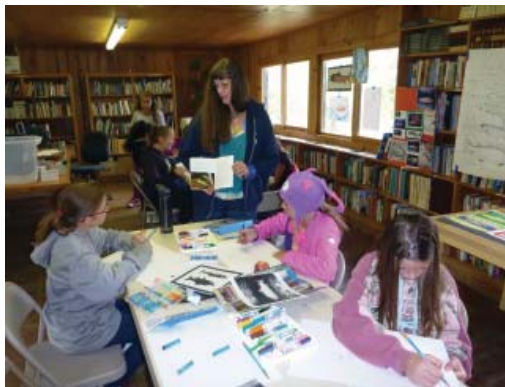
Creating salmon posters is a popular activity at environmental camp.