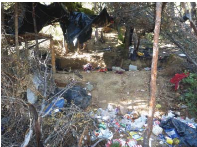
One of the camps found at a trespass grow site in the Shasta-Trinity National Forest.