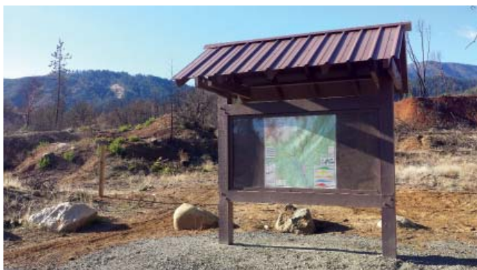
New trailhead kiosk and map.