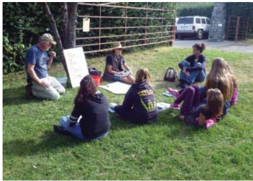
Learning how to use a compass.