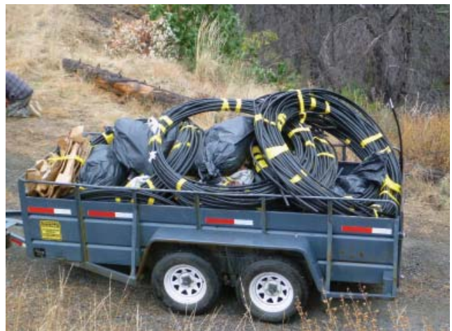
One trailer-load of garbage and irrigation piping removed from a reclaimed trespass grow site.